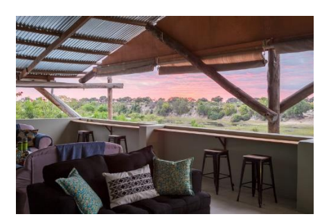
Day 4-7 BUSHWAYS SABLE ACCOMMODATED MOBILE SAFARI Moremi Northbound, Moremi Game Reserve