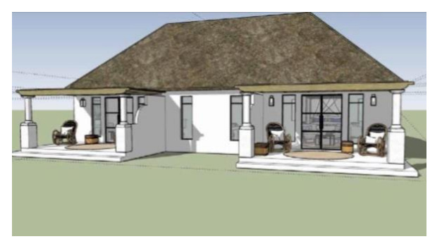
Day 3 Bushways Sable Accommodated Mobile Safari Northbound Boteti, Xhumaga