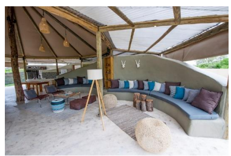
Day 7-9 Bushways Sable Accommodated Mobile Safari Northbound Chobe, Chobe Forest Reserve