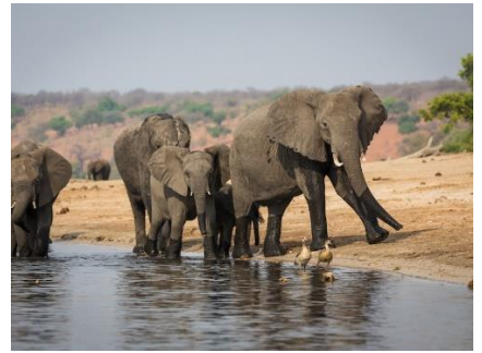
Day 9-11 Bushways Sable Accommodated Mobile Safari Victoria Falls Northbound, Victoria Falls (Zimbabwe)