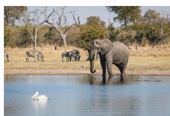
Day 13 Bushways Leopard Mobile Safari Savute, Savuti - Chobe National Park