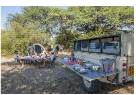
Day 9 Bushways Leopard Mobile Safari Campsite outside Maun, Okavango Delta