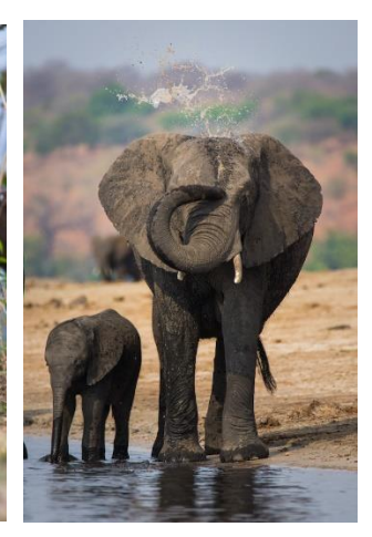
Day 14-16 Bushways Leopard Mobile Safari Chobe, Chobe National Park