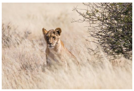
Day 6 Bushways Leopard Mobile Safari Boteti, Xhumaga