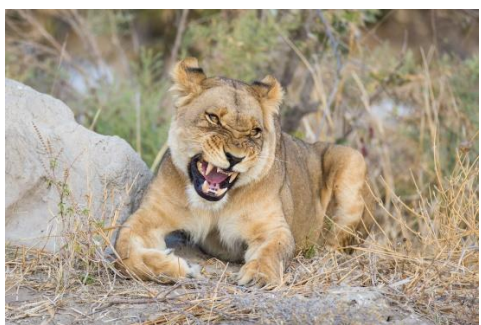
Day 16 Bushways Leopard Mobile Safari Victoria Falls, Victoria Falls (Zimbabwe)