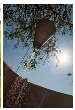
Day 7-9 Bushways Leopard Mobile Safari Okavango Delta, Okavango Delta