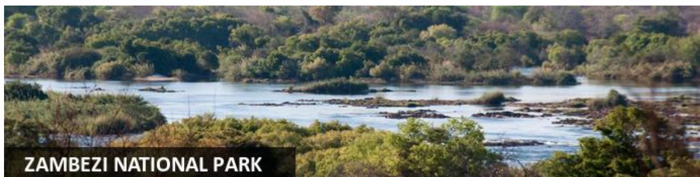
ZAMBEZI NATIONAL PARK

On arrival at Victoria Falls Airport, you will be met by an Old Drift Lodge representative who will assist with your road transfer to the lodge. Here, you will stay for two nights on a fully inclusive basis.