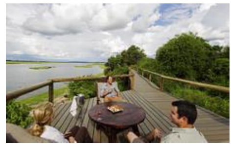
Day 5-7 Savute Safari Lodge, Savuti - Chobe National Park