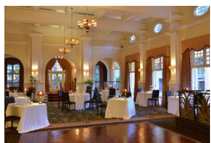
Day 3-5 Chobe Game Lodge, Chobe National Park