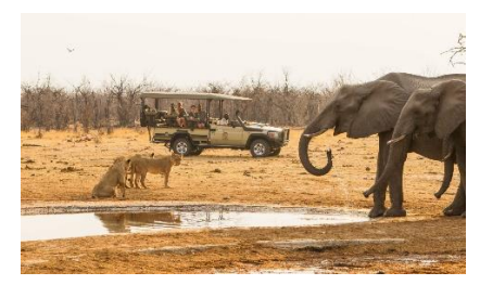
Day 7-9 Camp Moremi, Moremi Game Reserve