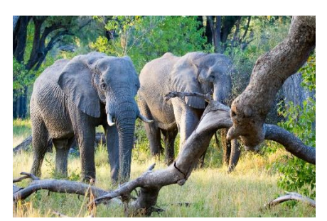
Day 9-11 Leroo La Tau, Boteti River - Makgadikgadi Pans National Park