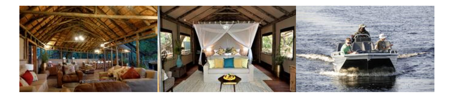
Day 7-9 Sango Safari Camp, Khwai Community Area

The permanent waters of the Okavango Delta's region are renowned for their exceptional birding, and aquatic wildlife is plentiful. Larger water dependent animals such as hippo and crocodile are frequently seen.