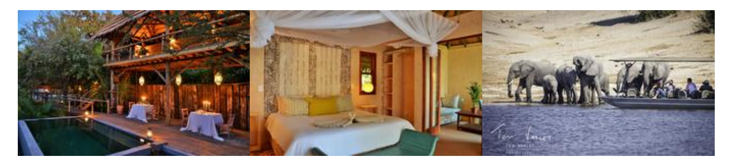
Day 5-7 Setari Camp, Okavango Delta

Following breakfast and a morning activity (flight time permitting), you will be transferred to Kasane Airport. A Mack Air representative will meet you on arrival to assist with check-in for your light aircraft transfer to Setari Camp, where you are met by your guide for the onwards boat transfer through to camp. Here, you stay for two nights on a fully inclusive basis.