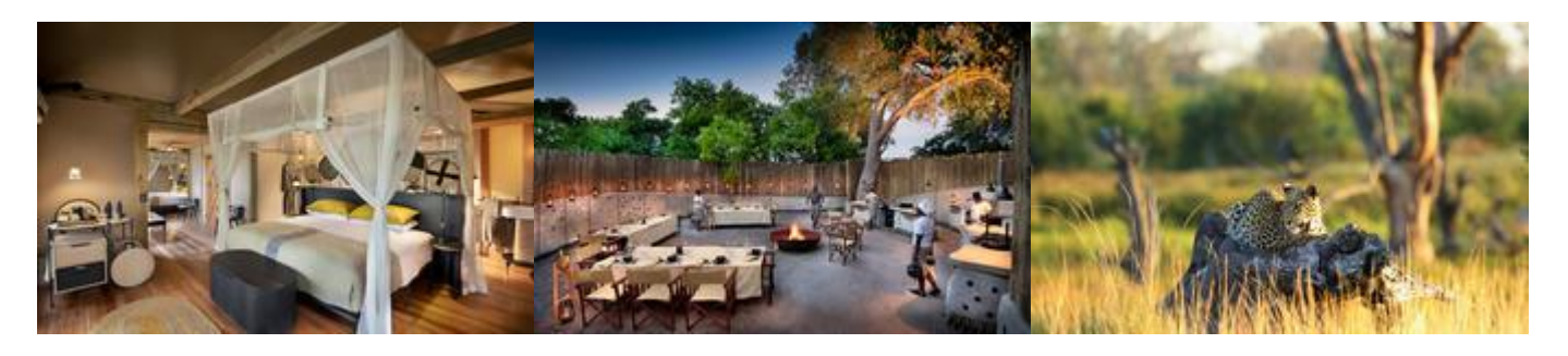
Day 4-7: African Bush Camps Thorntree River Lodge, Victoria Falls (Zambia)

Airstrip Transfer Time: 30 minutes from Khwai Airstrip