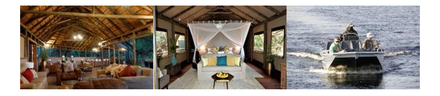
Day 7-9 Sango Safari Camp, Khwai Community Area

The permanent waters of the Okavango Delta's region are renowned for their exceptional birding, and aquatic wildlife is plentiful. Larger water dependent animals such as hippo and crocodile are frequently seen.